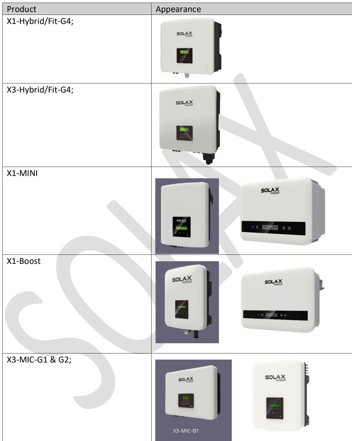
Table 2: Product and Appearance